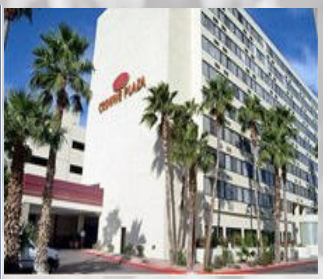
Crowne Plaza Hotel PHOENIX-AIRPORT 4300 EAST WASHINGTON PHOENIX, AZ 85034

The Crowne Plaza Hotel is proud to be the "Official Hotel" of the 2007 Herb Sendek Basketball Camps.